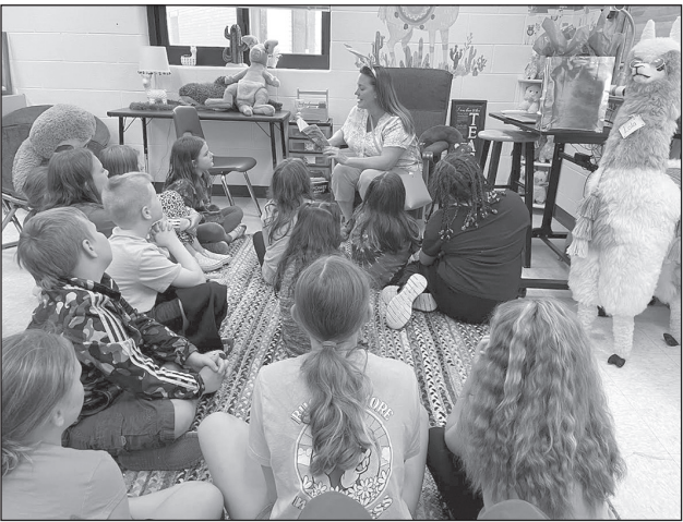
Holton Elementary students reading Kenny & the Dragon