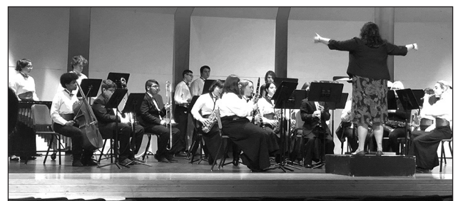
The High School and Junior Bands traveled to Shelby on March 4th to play at MSBOA District I Festival. The students did a great job!