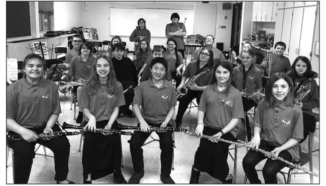
Students who performed March 9th at the school board meeting.