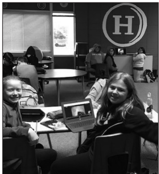
Middle School students participating in Project Focus.

Project Focus is a FREE after school program by TrueNorth where students stay for dinner and can get tutoring or homework assistance. Students also have the opportunity to do learning enrichment activities, hands-on building & creativity projects, sports & recreation experiences, exploration of music, drama, & colleges/careers, and participate in community projects.